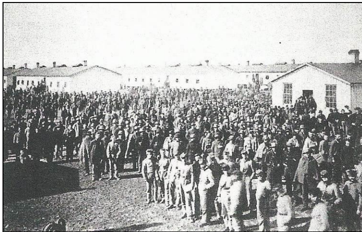
Enlisted men in Camp Douglas, Around September 30, 1864