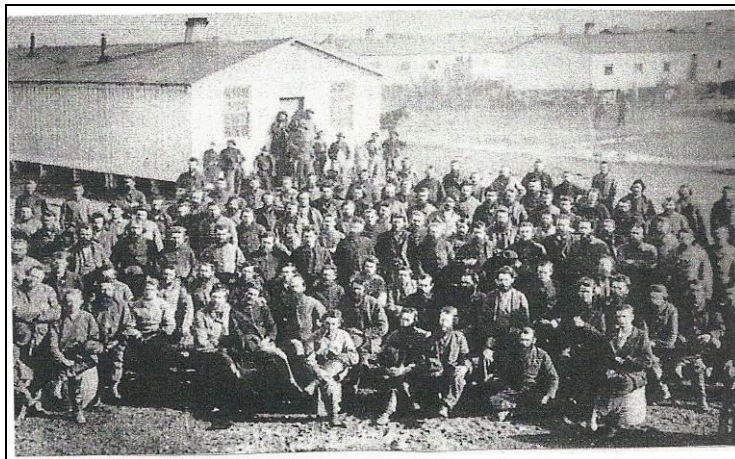
Confederate Officers in front of the sutler's store September 1864