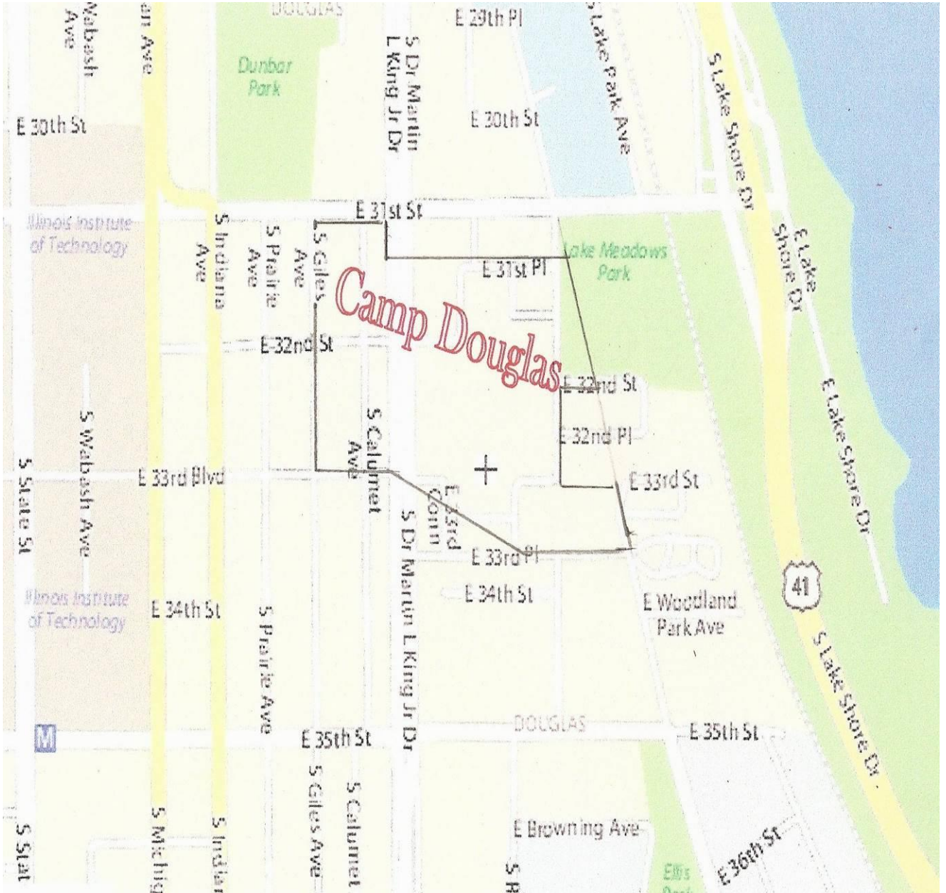
Site of Camp Douglas with contemporary streets

Camp Douglas was located at 31 st Street on the north, 33 rd Place on the south, Cottage Grove Avenue on the east and South Giles Avenue on the west. The western boundary of the camp is Giles Avenue. The camp consisted of approximately sixty acres, with the main access on Cottage Grove near 32 nd Place.