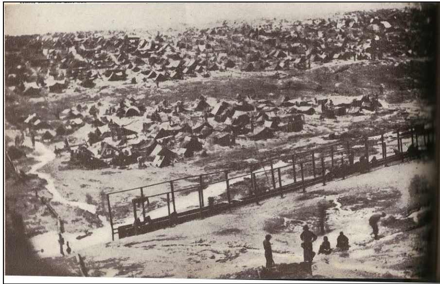
Andersonville Prison seen between March and August 1864

Confederate camps frequently provided no shelter from the elements. The infamous Andersonville in southern Georgia is a prime example where prisoners were required to provide their own shelter using material available in the camp.