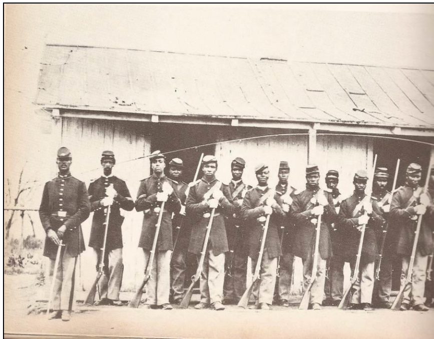
107 th U.S. Colored Infantry, Ft. Corcoran Washington DC