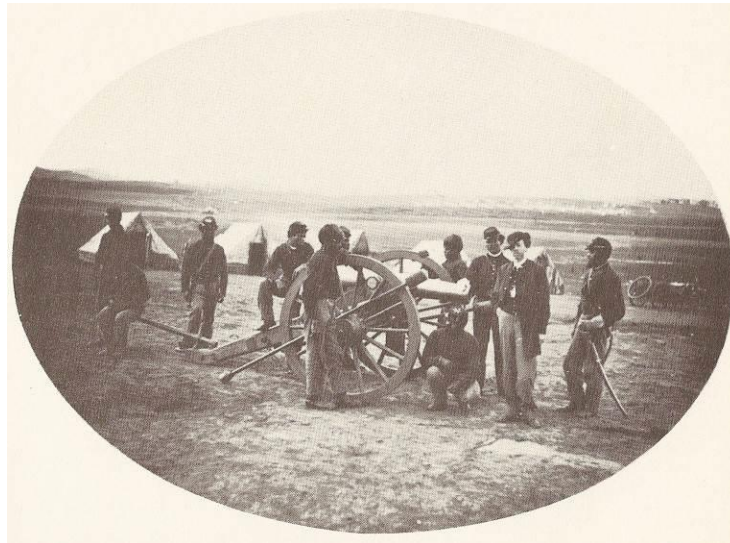
2d U.S. Colored Light Artillery-Battle of Nashville

We'll fight for liberty, We'll fight for liberty, We'll fight for liberty, Den de Lord will call us home. African American Folk Song, cir. 1860